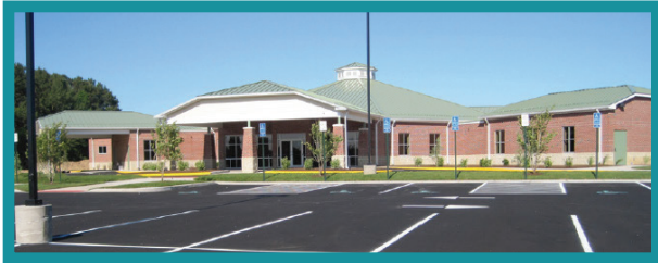
Sant Sante Kominotè Atlantic Rural Health la

Eastern Shore Rural Health System, Inc. se yon sant sante kominotè ki kalifye pou jwenn èd gouvènman federal. Nan ane 1976, yon gwoup moun ki te gen vizyon pou fè anpil efò pou amelyore swen sante sou Lakòt Lès Virginia te fòme Rural Health. Sant sante sa a te vin pwofesyonèl swen medikal plis pase mwaye popilasyon reyon an te chwazi.